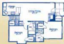
Willow - 2 Bedroom 890 Sq. Ft.