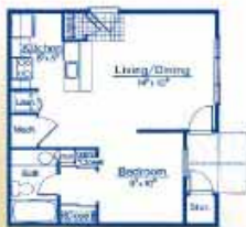
Bayberry - Studio 590 Sq. Ft.