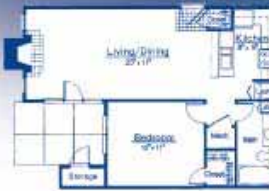
Blue Spruce - 1 Bedroom 745 Sq. Ft.