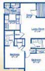
Hickory - 2 Bedroom 940 Sq. Ft.