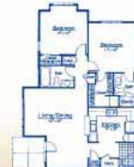
Linden - 2 Bedroom 1000 Sq. Ft.