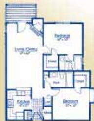
Hawthorn - 2 Bedroom 875 Sq. Ft.