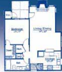
Aspen - 1 Bedroom 780 Sq. Ft.