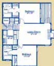
Maple - 2 Bedroom 850 Sq. Ft.