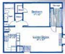
White Spruce - 1 Bedroom 715 Sq. Ft.